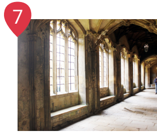
7 Cloisters Christ Church