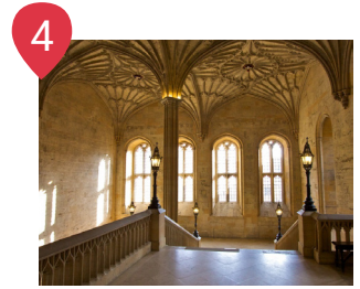
4 Stairway (top) Christ Church