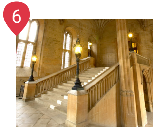
6 Stairway (bottom) Christ Church