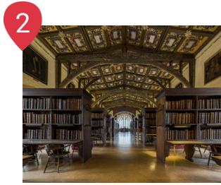
2 Bodleian Library Duke Hampshire Library