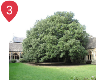
3 New College Cloisters