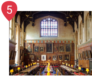
5 The Great Hall Christ Church